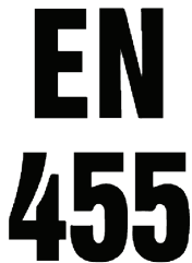
European Nation Standards

Our commitment to continuously deliver our products on global scale with consistent quality made us compliant with all standards.