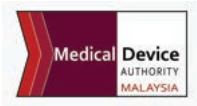
Medical Device Authority Malaysia